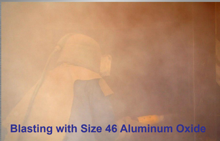
Blasting with Size 46 Aluminum Oxide

Solution: Better visibility, increased productivity